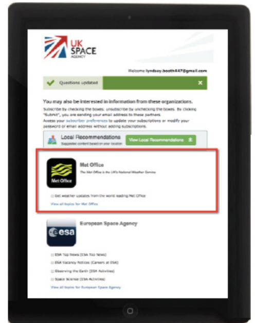
Prime placement in GovDelivery Network.

To drive more downloads of the app among subscribers, Granicus designed and implemented a custom footer (see example opposite) for use across the Met Office's email updates. Granicus crafted a series of five email messages targeting existing subscribers, aligning the artwork and messaging with the Met Office's winter campaign collateral.