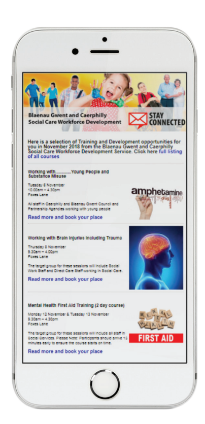
Example email bulletins